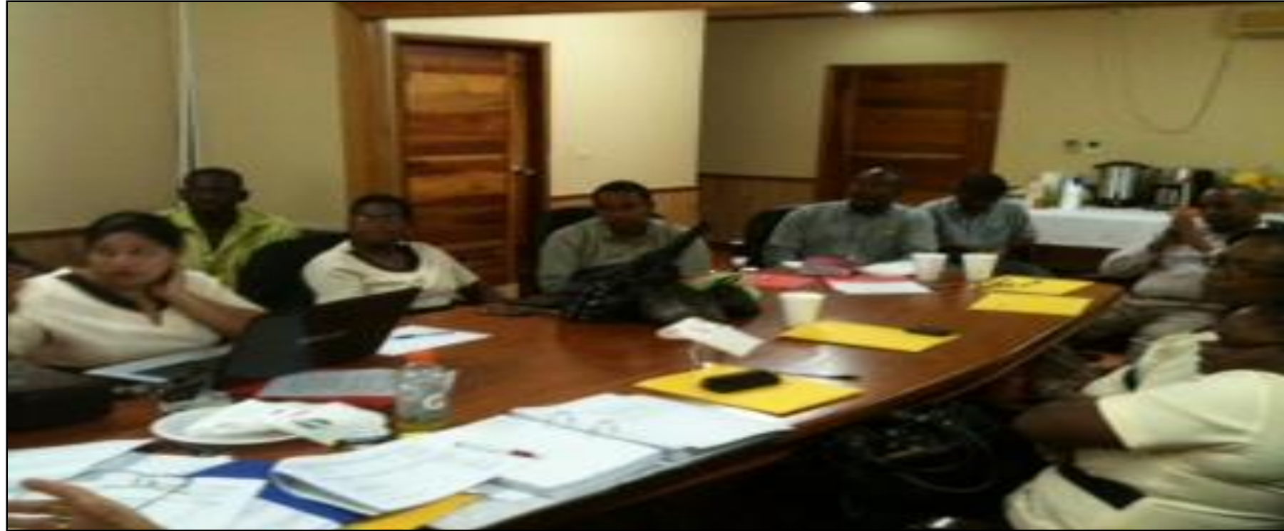
SAI Belize during presentations of audit work